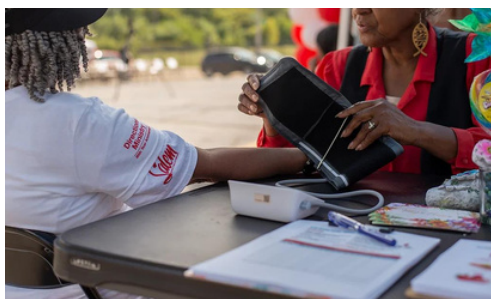
Directions Ministry 20th Anniversary