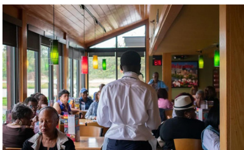
2019 Prayer Breakfast fundraiser