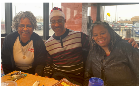
2022 Christmas breakfast fellowship