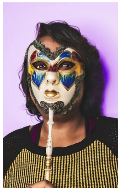
Day of Beauty for Survivors hosted by Paul Chambers Salon